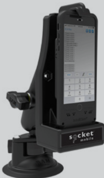
Vehicle Charging Dock

The Vehicle Charging Dock is a mounted charger for the DuraSled that provides users the freedom to charge their scanner and phone while on the go.