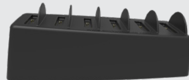
6 Bay Charger

The 6 Bay Charger charges multiple DuraSled devices within a single docking station. This desktop solution is perfect for large offices, conference rooms, vehicle fleets, and other applications requiring mass charging of multiple DuraSleds.