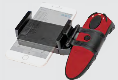
Scanner & Phone Holder