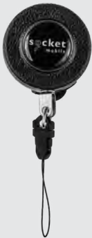
Durable Retractable Clip